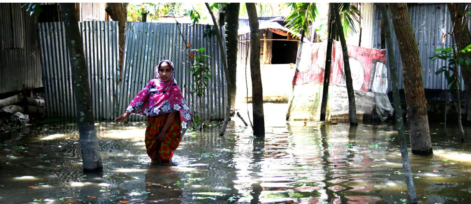
Flooding in Bangladesh.