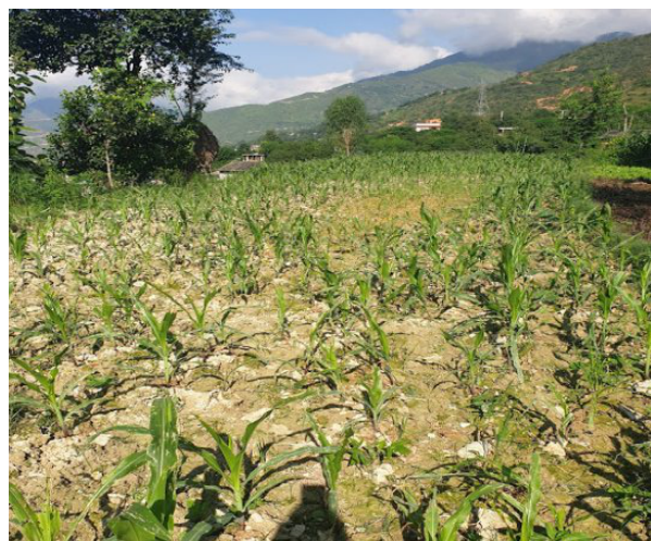
Fall Army worm in Ramchap, Nepal.

workers, 38% of Bangladeshi workers, 36% of Pakistani workers, 24% of Sri Lankan workers, work in the agricultural sector. 11 This sector is particularly vulnerable to climatic variability, as both short-term crop yields and the long-term sustainability and fertility of agrarian lands are greatly shaped by climatic factors. 12