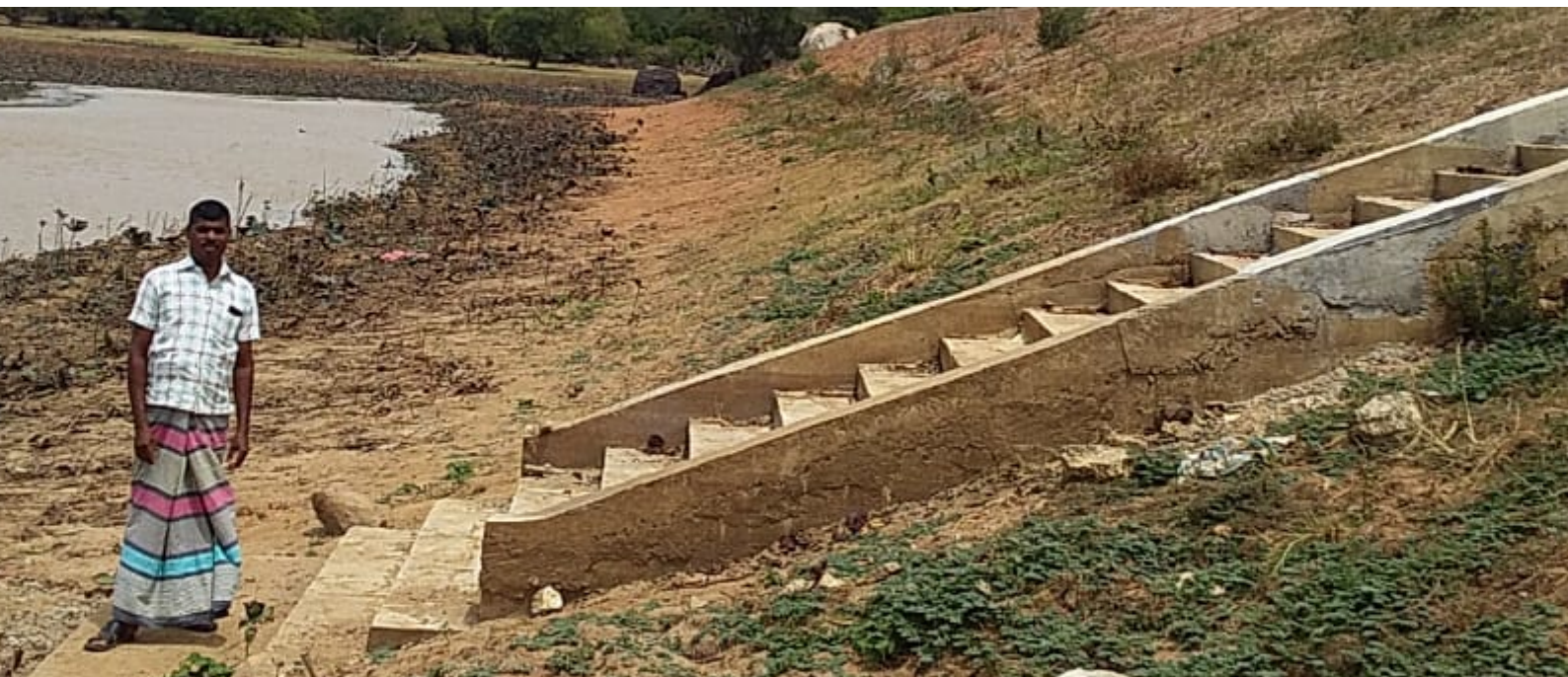
Water level depletion in village tank during the dry period, Parangiyawadia, Sri Lanka.