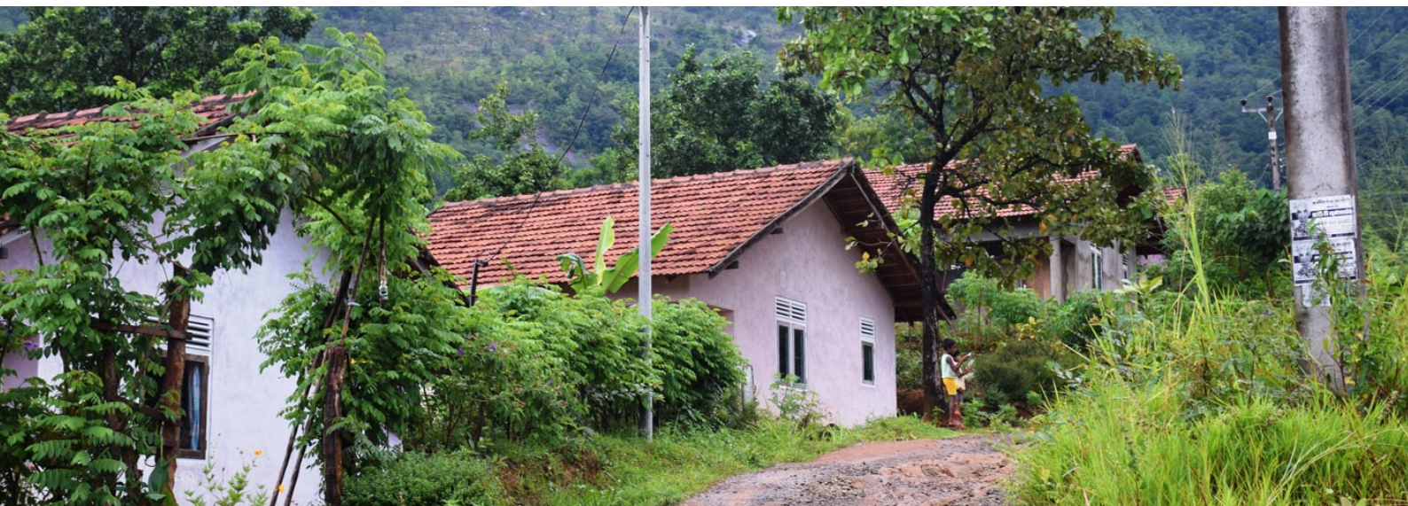
New housing scheme at Kalugala, Sri Lanka.