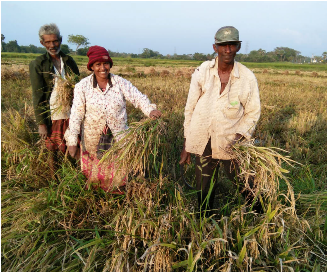
Harvesting paddy, Parangiyawadia, Sri Lanka.

communities and the ecosystem. Industrial agriculture globally produces nearly a quarter of the world's GHG emissions even though small farmers and subsistence farmers feed a majority of the world on less than a quarter of land. 58 The intensive nature of industrial agriculture, and its widespread use of monocultures, also leaves crops particularly vulnerable to failure in the face of increasing climatic extremes where months of high temperatures are followed by heavy and persistent rainfall at unusual times.