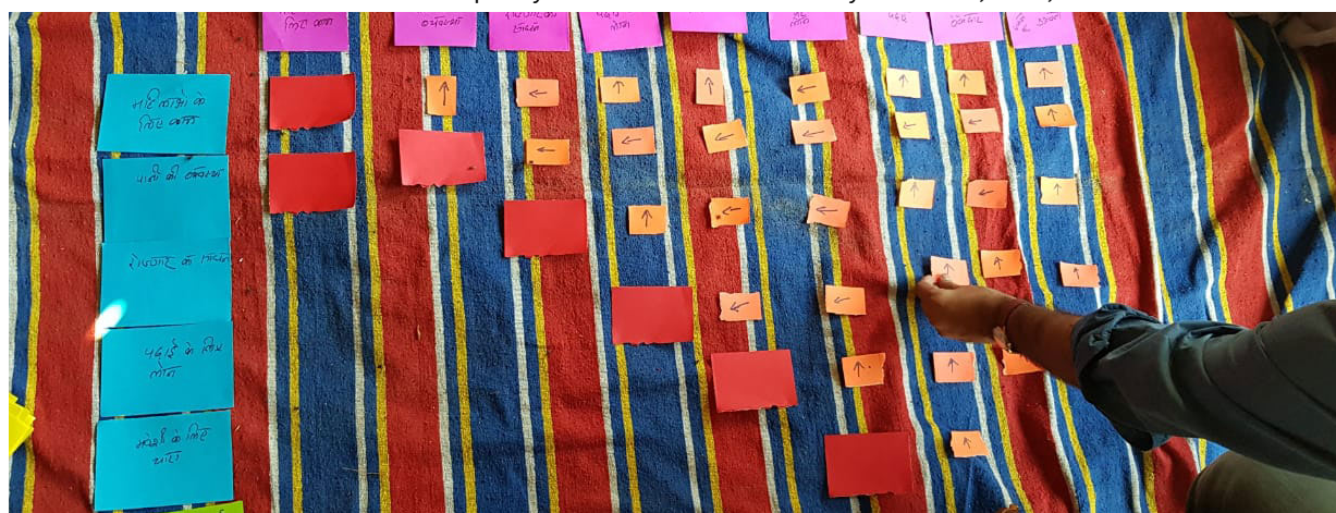
Participatory exercise with the community in Saharsa, Bihar, India.

Gendered vulnerabilities need to be addressed through forms of social protection that increase autonomy and agency for women, and can include cash transfers alongside guaranteed income in recognition of care work and access to maternal healthcare, for example.