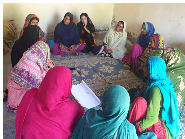
Participatory session with women in Pakistan.

Women living in flood-affected Sirahar District in Nepal shared that in absence of male members, who often migrate for work, women find life very difficult back at home. They are left behind to take care of household chores, agricultural activities, look after children and elderly and manage livestock. Doing all this single handedly is often a struggle for them. Pregnant women faced even more stressful time especially in case of a flood situation. They seek help from their neighbours or extended family. Community discussions also revealed that in such situations, families tend to rely more on the young girls; burdening