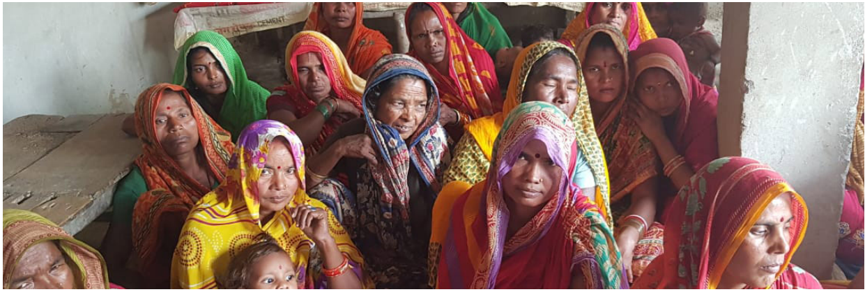
Community participatory session with women in Saharsa, Bihar.

Women migrants from Gaukhel in Maharashtra, India, spoke about how they had to wake up at 3 am to prepare food for the family, then labour at sugarcane cutting all day until they returned home at 6pm. They also had to fetch water from long distances, look after children and tend to livestock on top of earning a daily wage.