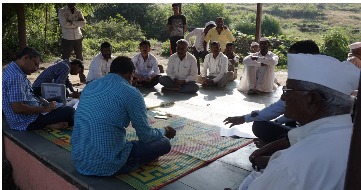
Participatory planning exercise in Beed, Maharashtra, India.

Progressive taxation policies will be key for raising domestic resources to cover all of these investments into resilience and addressing loss & damage. Sri Lanka spends almost half of its government revenue (47.6%) on debt repayments. Pakistan spends 26.5%, while Bangladesh spends 14.6% of state revenue on debt repayments; nearly three times the state's own health spending. 46 Debt cancellations can significantly contribute to giving climate vulnerable countries the fiscal space to prioritise introducing measures that protect and promote human rights. Similarly, ensuring that loans do not come with conditions that require harsh macroeconomic policies inconsistent with such levels of state spending and support will be necessary to facilitate such policies.