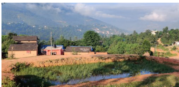
Recharge pond in Ramechap, Nepal.

Justice centered disaster preparedness, risk management and reduction policies are essential. Disaster risk reduction strategies save lives.