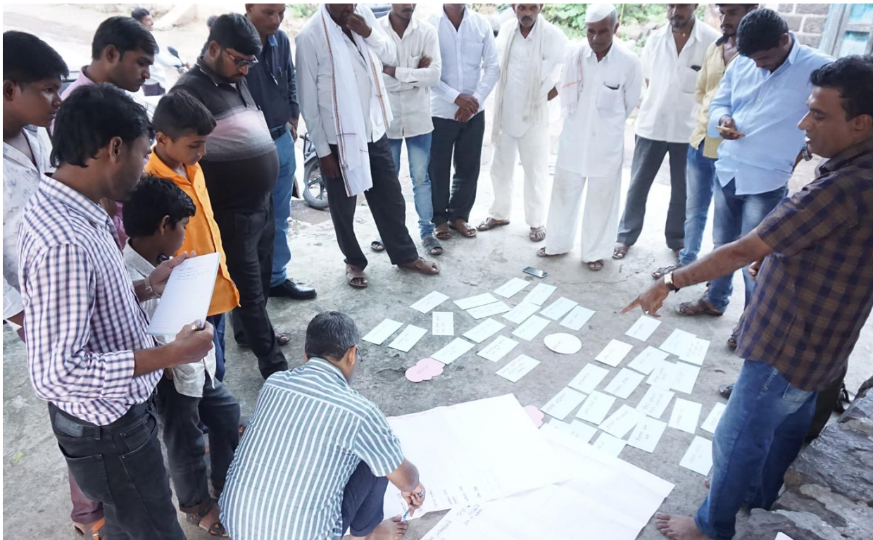
Participatory session with rural youth in Beed, Maharashtra.

In spite of being widely excluded from political institutions and sidelined from formal decision-making spaces, young people are powerful agents of change. Youth-led movements are leading the way and achieving transformative progress on issues of climate justice, gender equality, and economic transformation, both in South Asia and across the world. Governments need to recognise the voice, expertise and potential of young people, working to better partner with and involve young people in designing responses to climate-induced displacement.