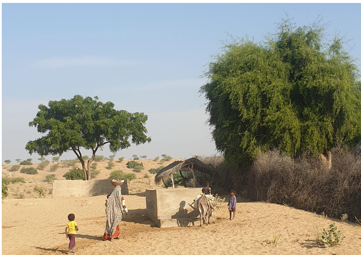
Woman fetching water, Pakistan.

such as South Asian Association for Regional Cooperation (SAARC), Bay of Bengal Initiative for Multi-Sectoral Technical and Economic Cooperation (BIMSTEC) and other Asia-Pacific forums. They should monitor the migration triggered due to extreme and slow onset disasters within the region and prepare policy responses to secure human rights of such migrants, in accordance with the recommendations of the UN Human Rights Committee.